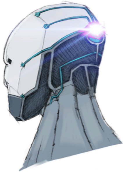
Concept Art Avatar of Asterion Space